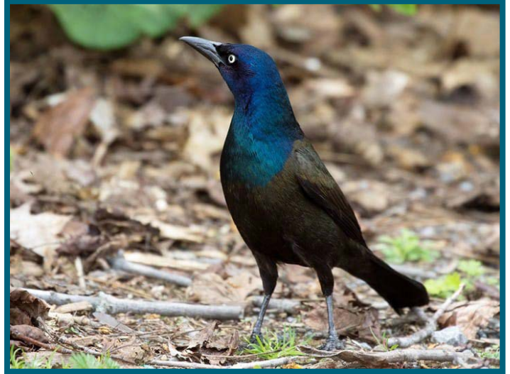
Common Grackle

COMMON GRACKLE: University of Idaho (1/20-CL)