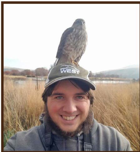
Unbaited Sharp-shinned Hawk (selfie)

In this presentation I will share my experiences during one Fall in Corpus Christi at the most diverse and numerous hawkwatch in the country!