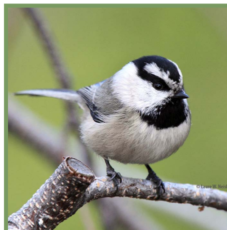
Mountain Chickadee