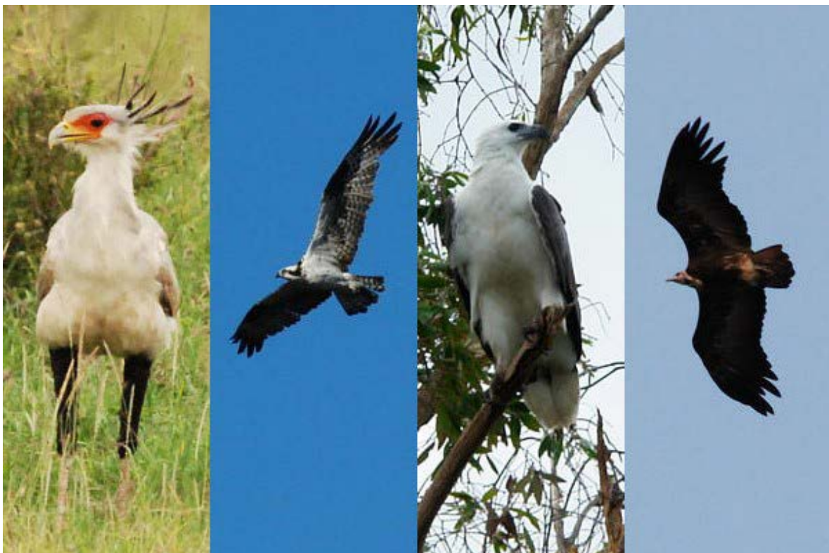
Secretarybird ( Sagittarius serpentarius), Osprey ( Pandion haliaetus), White-bellied Sea Eagle ( Haliaeetus leucogaster), Hooded Vulture ( Necrosyrtes monachus)