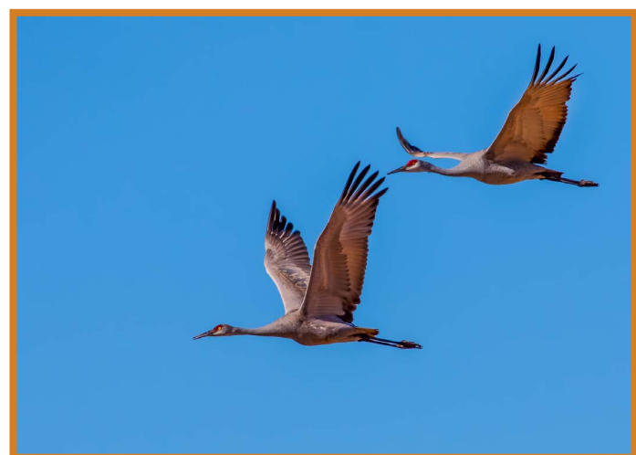
Cranes in flight by Leonard James