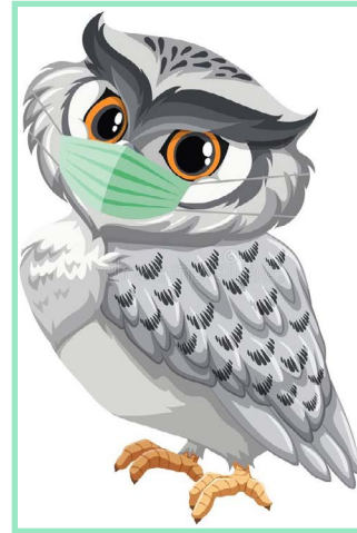
Drawing courtesy Dreamstime

Due to the pandemic, organized field trips are on hold until further notice